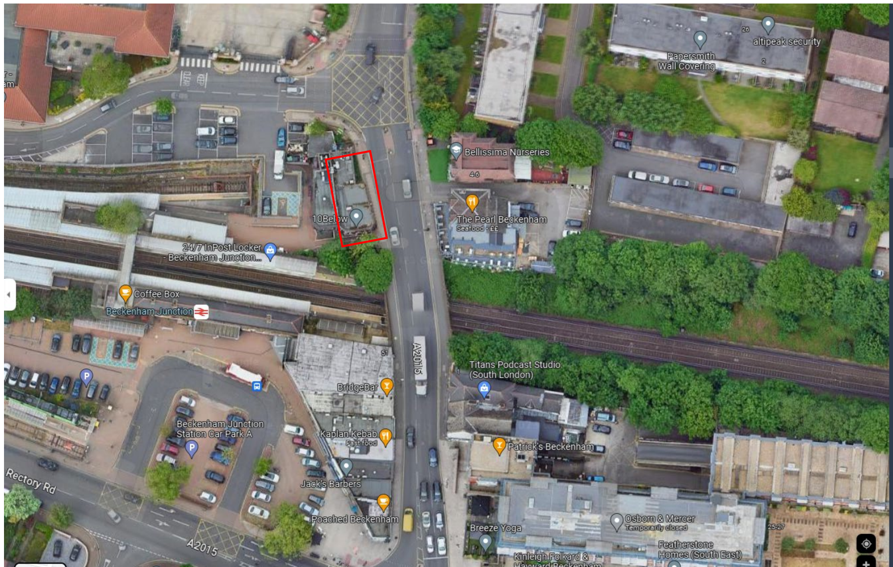
Satellite Image of 1-4 Southend Road, Beckenham